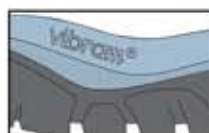
Undercut lugs for IMPROVED STABILITY